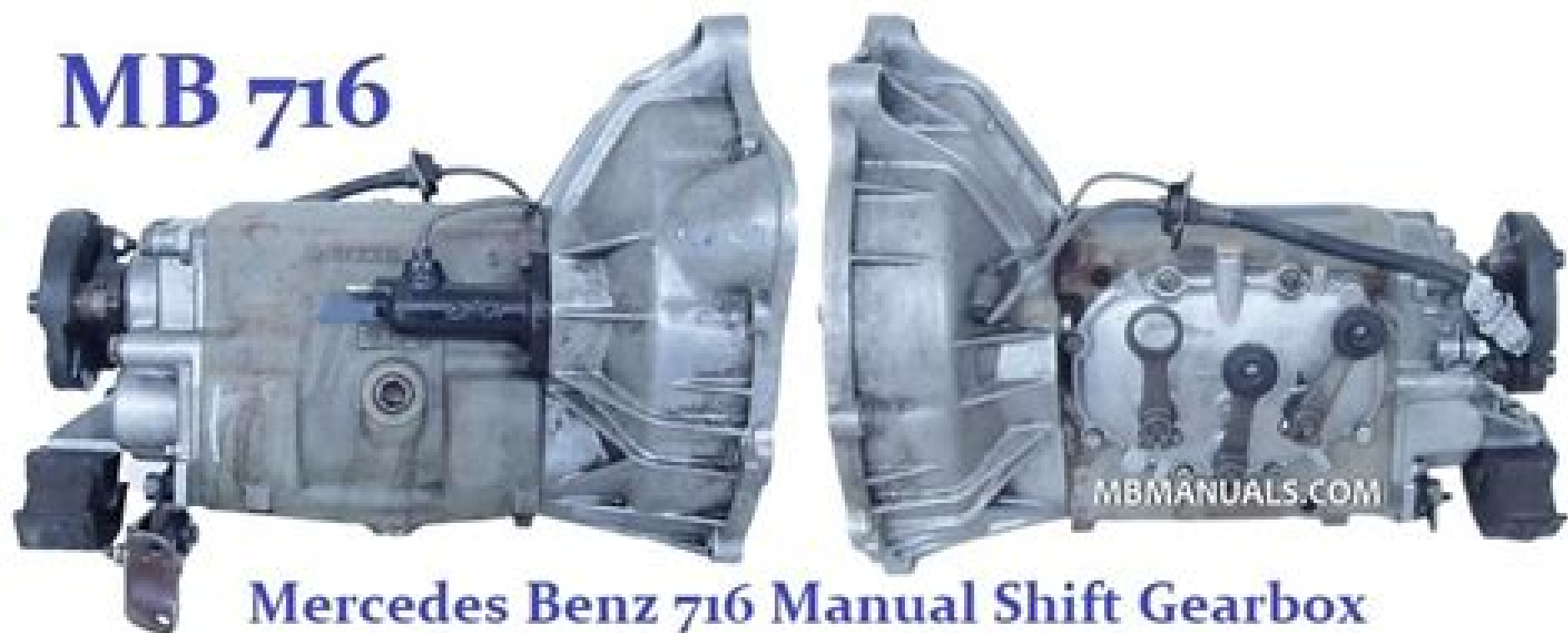
Mercedes Benz 716 Manual Shift Gearbox