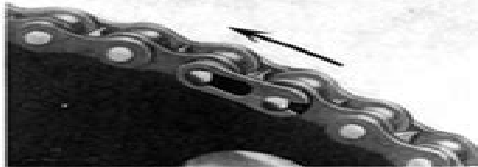
28 H: Lage der Kettenschloßsicherungsfeder