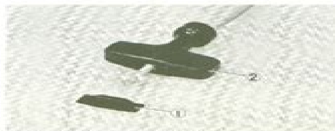
1. Handle cap 2. Starter handle

bearing securing bolts, and install the bolts and a bearing retainer onto the spacer. Torque the bolts to specification.