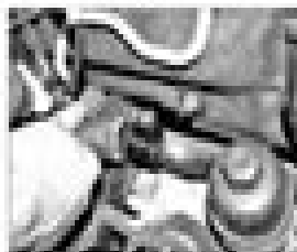
4.15 Disconnect the coolant hose