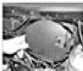
4.17a Remove the ECM cover