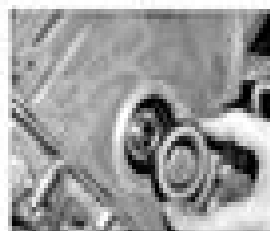
15.1e Fit the seal nut into the cover