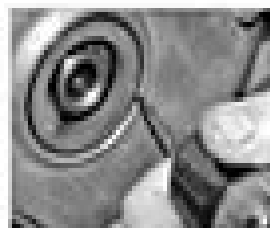
15.1b ... on all the seal and fit a nut