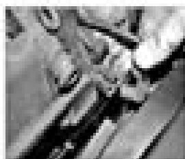
4.13b Put off the vacuum hose to disconnect