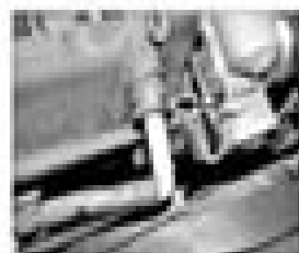
4.13a Remove the timing roller assembly for the location hole