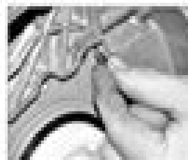
15.1h Fit the shims back into position

seals and the oil seal housing is to be fitted position.