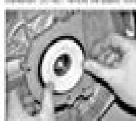
15.1g Fitting the seal housing with plastic shims in position