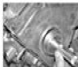
15.1f ... and using a drift to keep it square. Tap it into the cover

Note that the timing belt must have been fitted. 6) Tight the crankshaft pulley as described in Section 4.