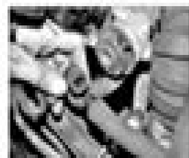
4.16 Disconnect the air hose