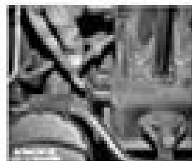
4.14 Disconnect the coolant hose