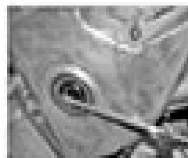
15.1a Doing a check-out to test out the seal