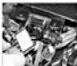
4.17b ... and disconnect the wiring from the timer plug