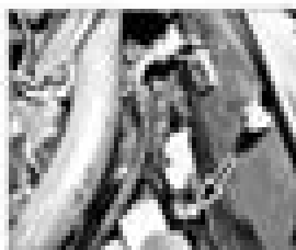
4.11 Disconnect the hoses - proceed