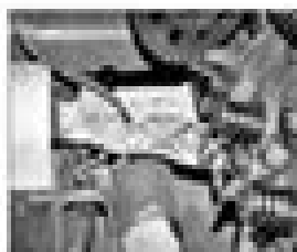
4.12 Undo water spraying nozzle - proceed