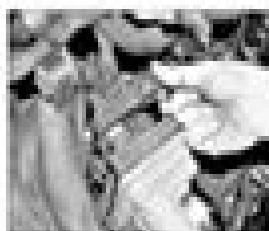
4.17 Disconnect the spring connection from the ECM

See Illustrations: Plug the ends of the pipes to prevent dirt ingress.