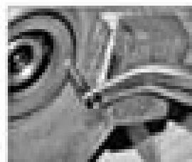
15.1c ... and put the seal nut from the cover