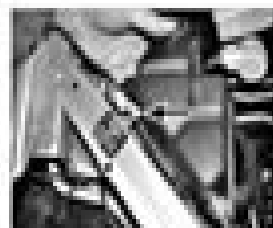
4.10 Disconnect the timing belt - proceed