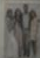
WE JUST WANT OUR GIRL BACK