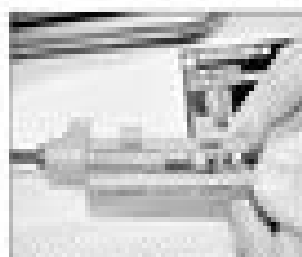
4.6g Separate the front section of the tensioner release cable