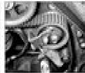
4.6p Timing belt tensioner engine codes A6P, A6T and A6J