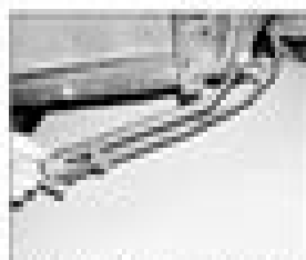
4.6b Connect the power steering fluid hose