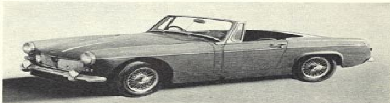
DISTINGUISHING FEATURES: Swivelling quarter lights and wind-up windows identify the Mark II cars in latest form, although styling in general follows the lines of previous models

All rights reserved. This Service Data Sheet is compiled by the technical staff of Motor Trader from information made available by the vehicle manufacturers and from our own experience. It is the copyright of this journal, and may not be reproduced, in whole or in part, without permission. While care is taken to ensure accuracy we do not accept responsibility for errors or omissions.