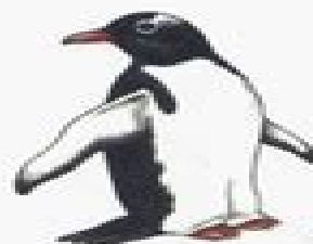
Pingüino Pico Rojo Chinstrap Penguin Pygoscelis adeliae / 40 cm