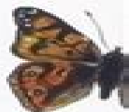
Dama Patagónica Patagonian Lady Vanessa atalanta 6 cm