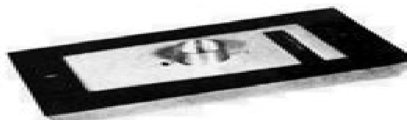
ADF 141 ANTENNA