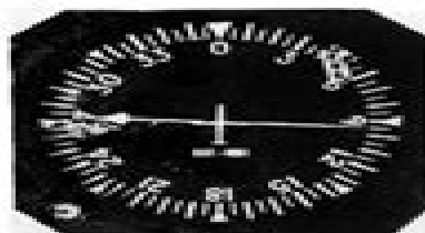
RMI 101 INDICATOR