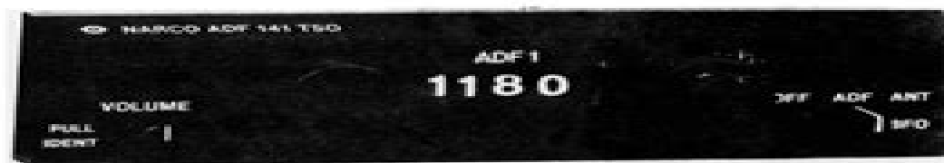
ADF 141 RECEIVER