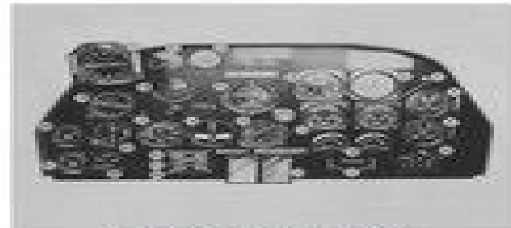
TYPICAL INSTRUMENT PANEL P-38A-25 Panel Diagram