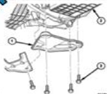
Fig. 6 Old Power Transfer Case