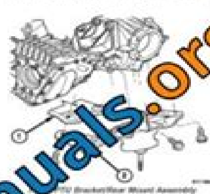
Fig. 5 POWER TRANSFER UNIT (Continued)