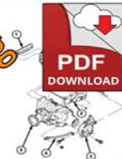
Fig. 7 Power Transfer Unit Mounting