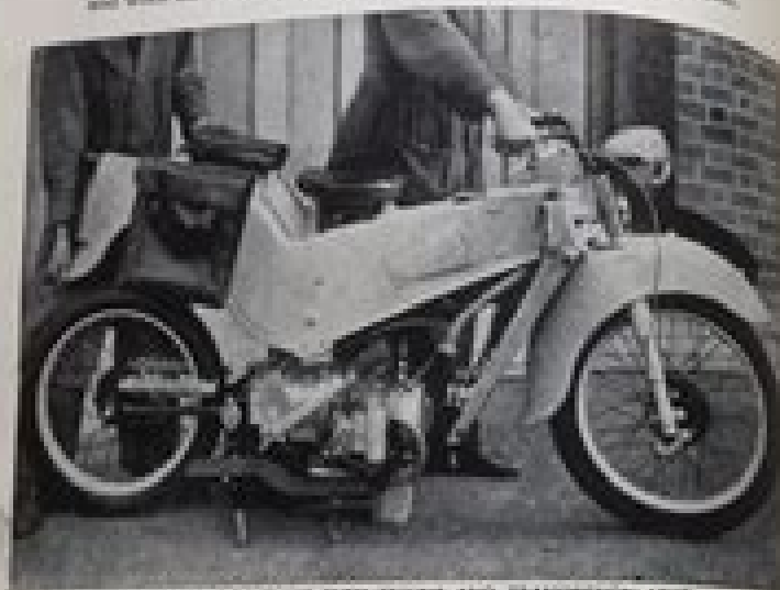
FIG. 13. REMOVAL OF SHAFTS FROM ENGINE AND TRANSMISSION UNIT

Run the engine slowly until the water in the cylinder jacket is hot and then stop the engine and go over all the cylinder head nuts, tightening any that require it. Let the water in the jacket cool down and when the water has cooled down fill the radiator to the correct level.