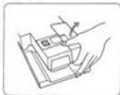
For free arm sewing

The extension table provides added sewing surface and can be easily removed for free arm sewing.