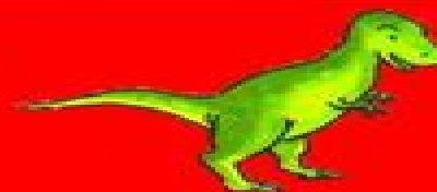
تيرانوسورس ريكس Tyrannosaurus Rex