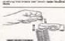
Fig. 7 The timing belt drive system. The timing belt is located at the front of the engine, driven by the crankshaft and drives the camshaft and water pump.

Notes, Cautions and Warnings are provided throughout the manual to help you avoid common mistakes and to ensure your safety. Always read these sections carefully before attempting any repair.