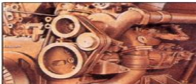
Fig. 4-4. Water pump with idler 28 IL series