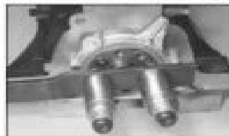
10.12a Home-made tool for holding the crankshaft stationary while the crankshaft pulley bolt is being loosened (engine removed for clarity)

Note: The removal of the crankshaft bolt means that the crankshaft is no longer held down by the main bearing cap. It is essential, therefore, to use a special device (numbered 112110 (M20 engines) or 112110 (M40 engines) for this purpose. If this tool cannot be bought or borrowed, check with a tool-shed or motor factors for a tool capable of doing the job. Note that the tool number 112110 bolts on the rear of the cylinder head and engages with the flywheel ring gear, so it will only be possible to use this tool if the gearbox has been removed, or if the engine is out of the vehicle (see illustrations). On