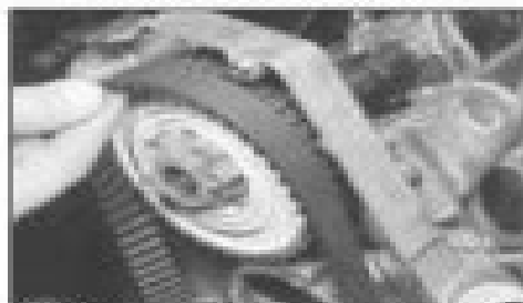
10.10b Removing the timing belt from the camshaft sprocket on the M40 engine