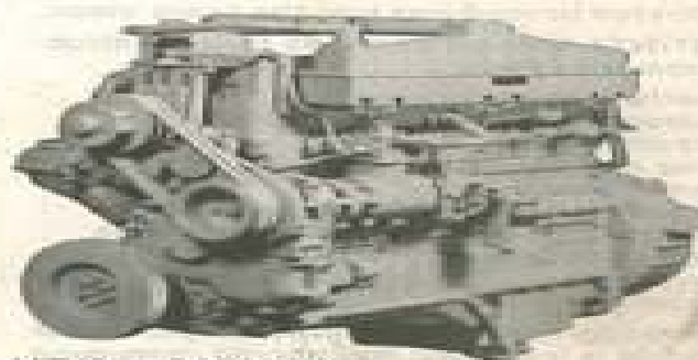
NT-855 Big Cam