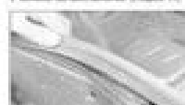
2-9: Radiator assembly (from top view of the radiator)

2-6: Radiator assembly (from top view of the radiator) 2-7: Radiator assembly (from side view of the radiator) 2-8: Radiator assembly (from front view of the radiator)