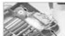
2-12: Radiator assembly (from top view of the radiator)