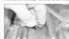
2-10: Radiator assembly (from side view of the radiator)