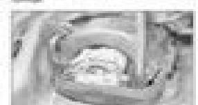
2-11: Radiator assembly (from front view of the radiator)