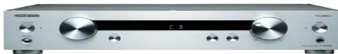
Black and Silver models