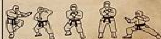
HICHO KOSEI JUMONJI HENKA JUMONJI KIHON IHEN HOGI