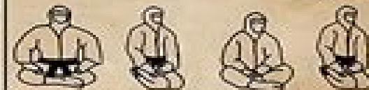
SUWARI GATA SEIZA FUDOZA SEIZA