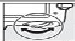
Main command dial