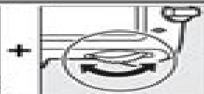
Main command dial