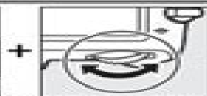
Main command dial