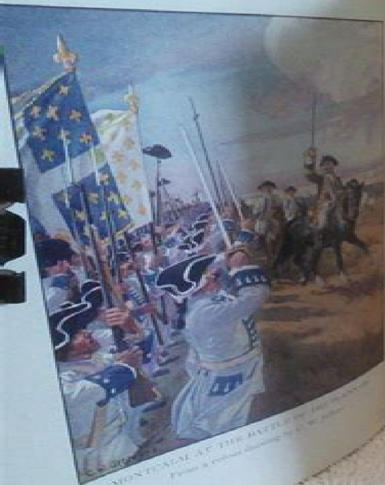
MONTCALM AT THE BATTLE OF THE CLOUDS Painted by Colonel de la Roche, 1759