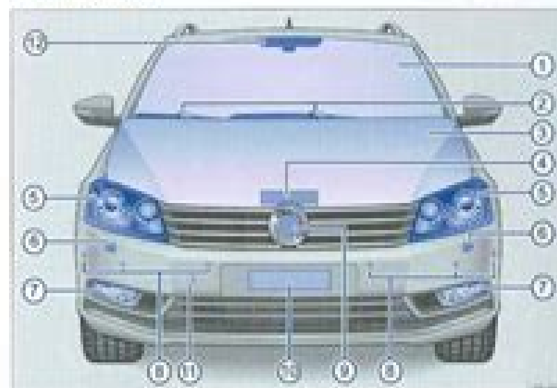
Rys. 2 Widok przodu samochodu