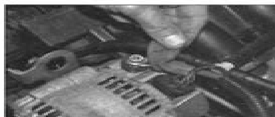
C Visually check engine harness connections/multipugs, including the alternator connectors.