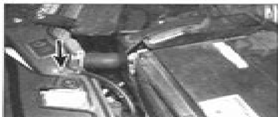
A A poor earth connection can cause intermittent faults in more than one circuit.