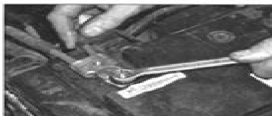
B Check the security and condition of the battery connections.