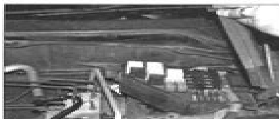
D Check the main fuse links, fuse and relays in the engine compartment fusebox.