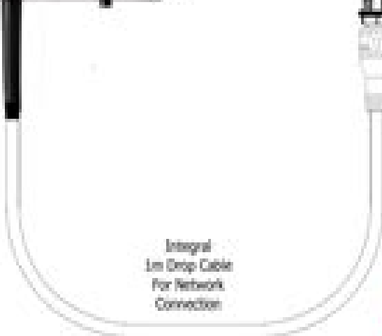
Integral 1m Drop Cable For Network Connection