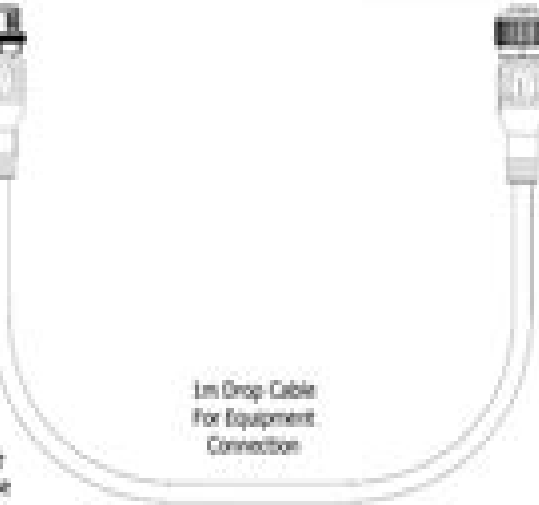
1m Drop-Cable For Equipment Connection