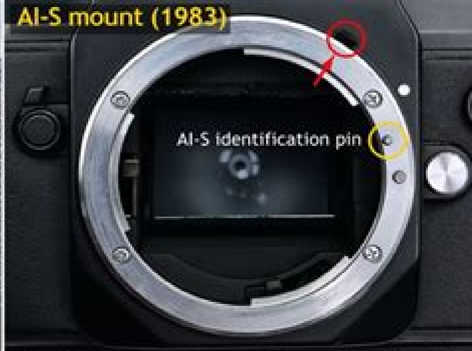
AI-S mount (1983)