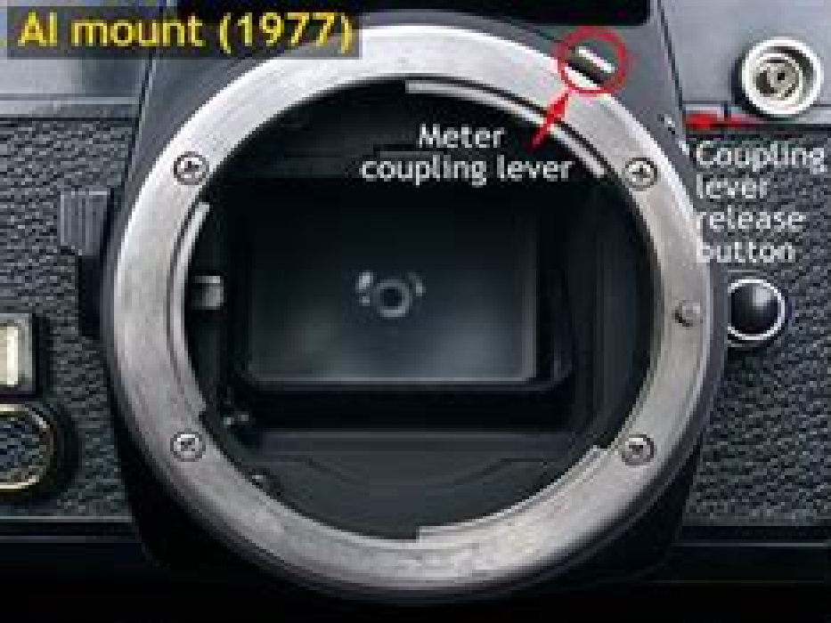
AI mount (1977)