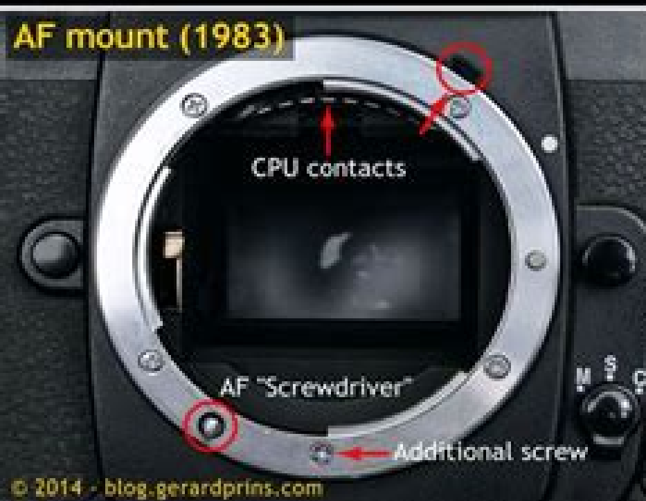
AF mount (1983)