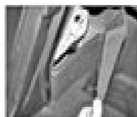
6.1c Pull back the carpet panel