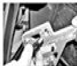
6.2c Push back in and fasten to remove