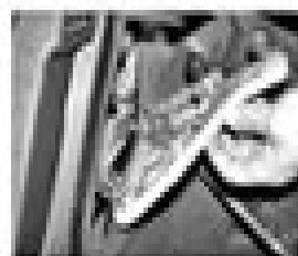
6.2b ... and remove the subframe