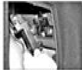
6.2b ... and withdraw the subframe