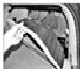
6.2d Remove the rear wing compartment