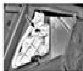
6.2a Release the locking cable