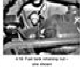
5.1 Fuel tank retaining rail - use shown

3 Disconnect the cooling system as described in Chapter 10.