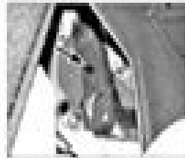
6.2a Remove the retaining clip

2 Remove the retaining clip, and then withdraw the subframe from the rear of the light unit. See Illustrations.