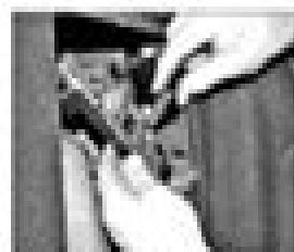
6.2c Push the bulb in and fasten to remove