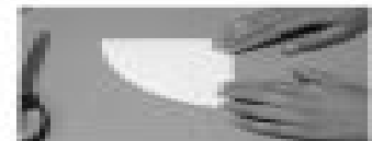
Figure 2a, 2b: Fold the paper circle in half, and then in half again.

Customer Support (800) 676-1343 E-mail: support@telescope.com