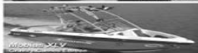
Mobius XLV cruiser edition