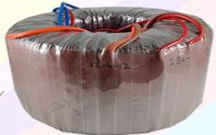
TOROIDAL TRANSFORMER 24-0-24 TO 30-0-30 AC