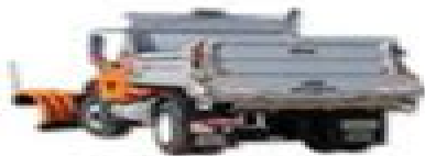
Spreader | Under Tailgate