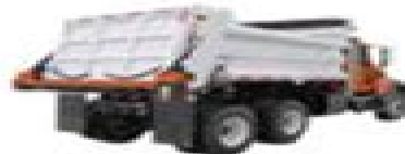
Spreader | Rollspreader