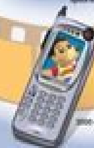
2000 - First camera phone is produced in Japan.