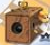
1888 - Kodak made the first film camera, which had a 13-foot film roll that held 100 photos. The made photography available to all! These photographs were 1.3 inches.