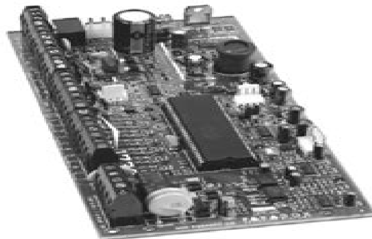
1738EX and 1738