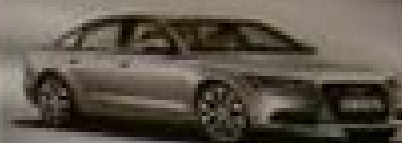
Audi's New Audi A4