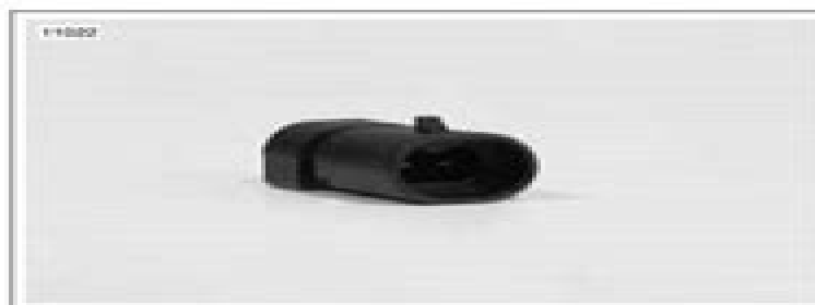
Figure 8-127. Resistive Plug