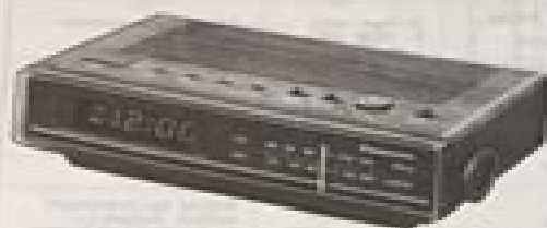
Simulated wood cabinet