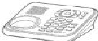
KX-TG9341S/T (Base Unit)