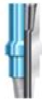
Type F Slip Sub