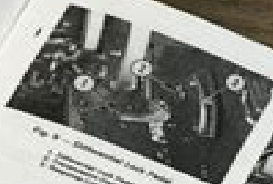
Fig. 5 — Instrument Panel 1. Shift Lever 2. Shift Pedal 3. Shift Pedal 4. Shift Pedal 5. Shift Pedal