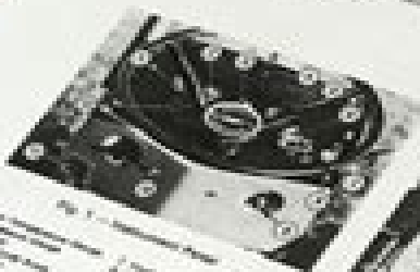
Fig. 1 — Instrument Panel

Before leaving, each student will observe at least control and instrument before starting flight. The student will be responsible for the proper use of the controls and instruments.