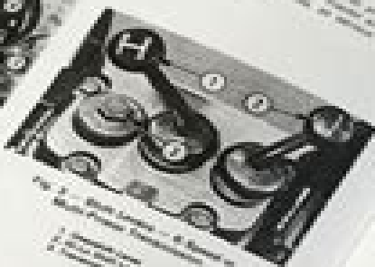
Fig. 2 — Shift Levers 1. Shift Lever 2. Shift Pedal 3. Shift Pedal 4. Shift Pedal 5. Shift Pedal