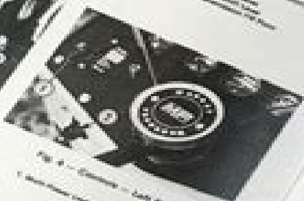
Fig. 4 — Controls 1. Shift Lever 2. Shift Pedal 3. Shift Pedal 4. Shift Pedal 5. Shift Pedal