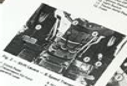
Fig. 3 — Shift Levers 1. Shift Lever 2. Shift Pedal 3. Shift Pedal 4. Shift Pedal 5. Shift Pedal