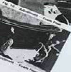
Fig. 10 — Instrument Panel 1. Shift Lever 2. Shift Pedal 3. Shift Pedal 4. Shift Pedal 5. Shift Pedal