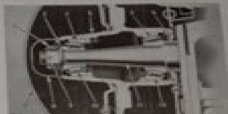
Front Wheel Bearing

If you desire detail mechanical information not given in the foregoing part of this book you will find, in the following pages, considerable mechanical descriptions and servicing procedures which will be of valuable assistance to you.