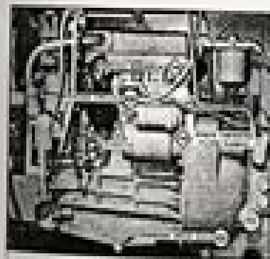
Fig. 30 - Left-Hand Side View of Gasoline Engine