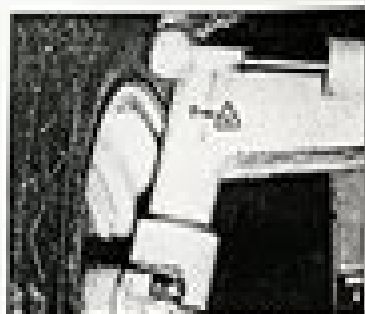
Fig. 24 - Front Axle Spindle Arm