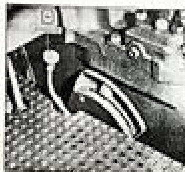
Fig. 31 - Transmission, Differential and Hydraulic System Dipstick (Also Reverse Converter in Inter-Reverse Models)