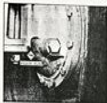
Fig. 32 - Axle Flareway Filler Plug - Diesel Models