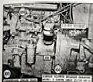
Fig. 29 - Left-Hand Side View of Diesel Engine