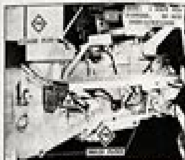
Fig. 27 - Transmission, Differential and Hydraulic System Drain and Fill Plugs -> Lift Cover Cross Shaft and Clutch Pedal First Lubo Points

NOTE: When Service Tank, Air and Oil Lines Check First Lubo Points.