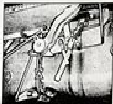
Fig. 25 - Brake Pedal Plots (Standard 4-Speed and Manual Shuttle)

Set Reverse Oil Pump Check Oil Level Through Top Plug. Reverse Plug, Air Lines to PTO Pump Converter. Reverse Oil Level in Supply.