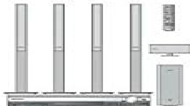
The illustration shows SC-HT900.