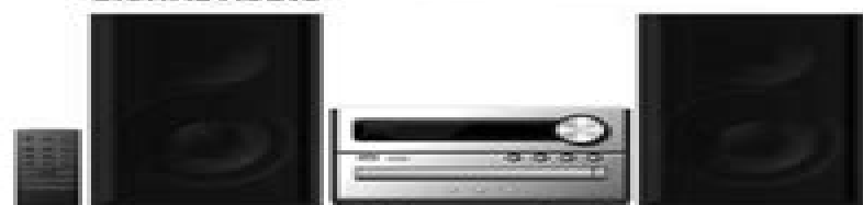
Remote SB-PM02 Control