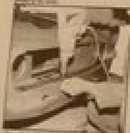
Work on the exterior is a major part of the rebuild. The car is now in the shop.