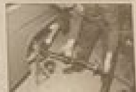
Work on the interior is a major part of the rebuild. The car is now in the shop.