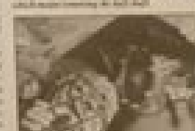
Work on the interior is a major part of the rebuild. The car is now in the shop.

An interim report as the GPO halts progress!