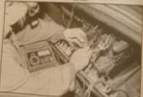
Work on the engine is a major part of the rebuild. The car is now in the shop.