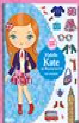
Kingdom of the Netherlands