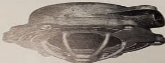
Cover for Explosion/Weatherproof Types

This series combines rate of temperature rise and fixed temperature detection.