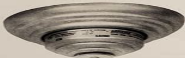
Rate of Rise and Fixed Temperature Brushed aluminum finish, for ceiling mounting on a 4-inch Octagon Box.