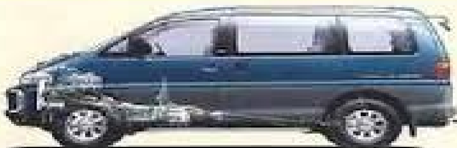
Mitsubishi Delica 1994-1999 L400