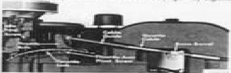
Figure 5. Idle Adjustment - Early MacCormac 120

MacCormac 120 thru 160, with throttle valve fully open, turn idle speed adjusting screw clockwise until screw just touches throttle lever. (Figure 5) Tighten