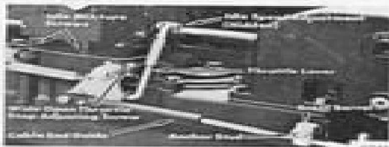
Figure 3. Idle Adjustment - MacCormac 120-160-180-190-200 (MacCormac 200 Choke Not Shown With Stage Forward)