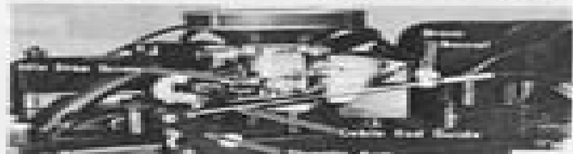
Figure 3. Idle Adjustment - MacCormac 80 (Throttle "Off" Model; float assembly on Opposite Side)

MacCormac 120 thru 160, with throttle valve fully open, turn idle speed adjusting screw clockwise until screw just touches throttle lever. (Figure 5) Tighten