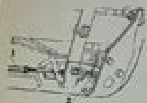
FIGURE 2 Rear axle assembly showing the axle housing and axle shaft