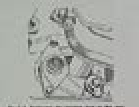
FIGURE 5 Rear axle assembly showing the axle housing and axle shaft