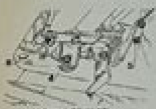
FIGURE 4 Rear axle assembly showing the axle housing and axle shaft